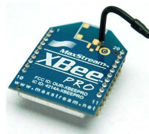
Figure 2: ZigBee module

ZigBee is a low-cost, low-power, wireless mesh networking standard. The low cost allows the technology to be widely deployed in wireless control and monitoring applications, the low power-usage allows longer life with smaller batteries, and the mesh networking provides high reliability and larger range.