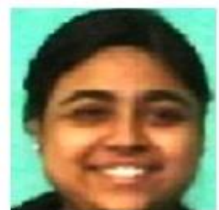
Face Image Name: pkb6.jpg