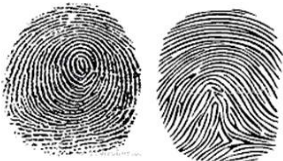
Thumb Fingerprint: tfp5.bmp