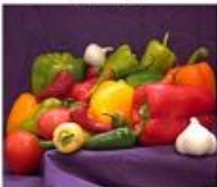
Figure 1. Target Image