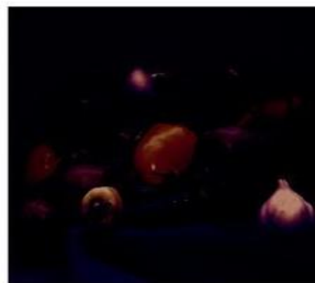
Figure 4. Color Transformed Image