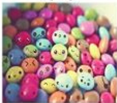
Figure 1. Target Image