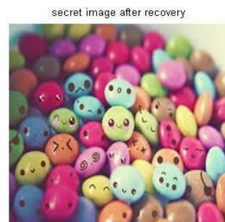
Figure 6. Secret image