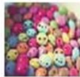
Figure 3. Block processed Image