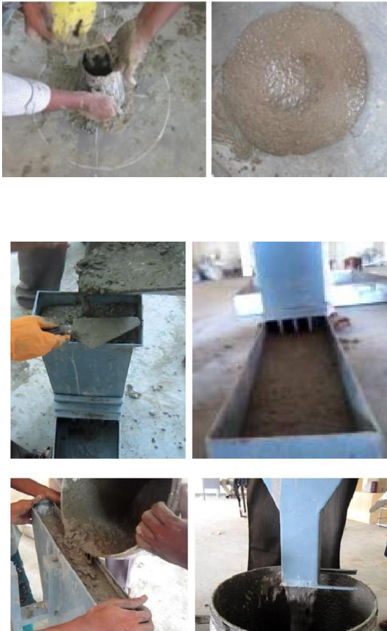
Figure 1: (a) Slump cone, (b) L-Box, (c) V-Funnel