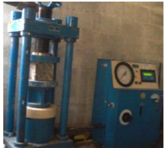
Fig-3 Compressive strength test