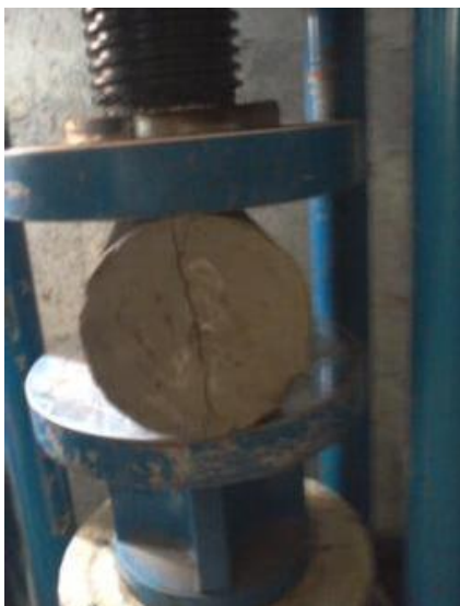
Figure 2: Split tensile strength test

Compressive strength test and split tensile strength test are conducted on hardened concrete at 3, 7 and 28 days and results are tabulated in Table -9 & 10. Both the tests are shown in the Figure-2 and Figure-3 below: