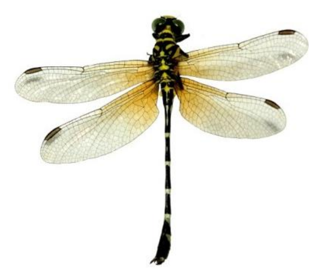
Fig.: 1 Microgomphus torquatus (♂)