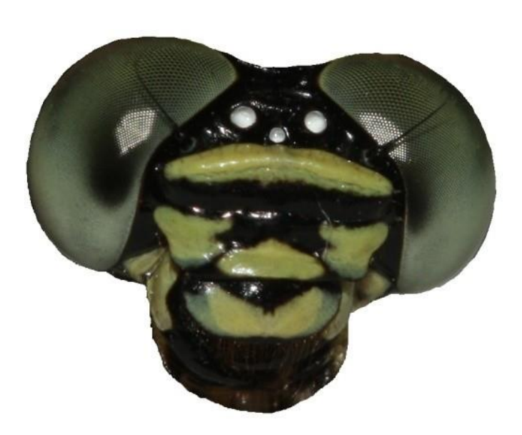
Fig: 2 Head of Microgomphus torquatus