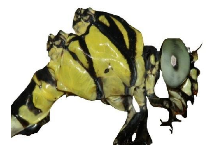
Fig: 3 Thorax of Microgomphus torquatus