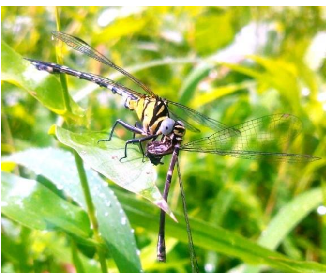
Fig 4 : Cannibalism Microgomphus torquatus over Disparoneura quadrimaculata ( \stackrel{\bigcirc}{\hookrightarrow} ).