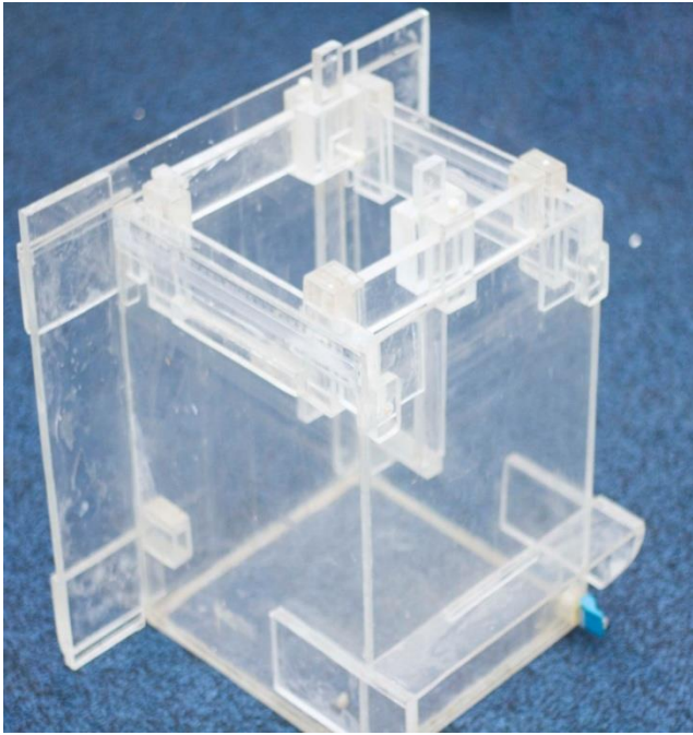
Figure 2: Cross sectional view of the locally constructed water phantom