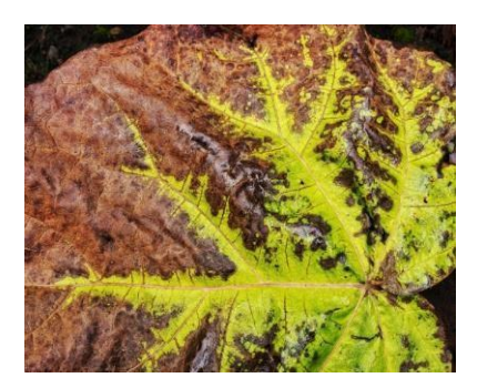
Fig 2. Image pre-processing

Image pre-processing is the method of enhancing data Moreover, the procedure of image pre-processing suggested cropping of all the images manually, making the intersection around the leaves, in order to highlight the region of share (plant leaves).