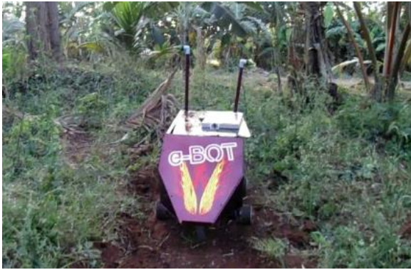
Figure 3. Solar E-bot