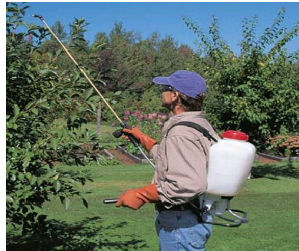
Figure 1. Backpack (knapsack) sprayer

plunger. Some of these sprayers can generate a pressure of 100 pounds per square inch (PSI) or more. Capacity of both these types of backpack sprayer is usually 5 gallons or more.