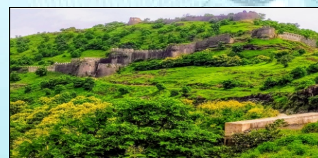
Wadi Fort (7Km.)