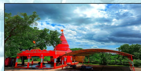
Bhairavnath Temple (3Km.)