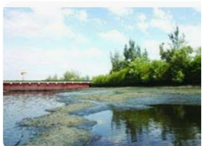
Fig 2 – Pollution on Thi Vai river

This criterion reflects the favorable level of social infrastructure such as the number of banks around the CCN; security protection inside and outside the area; number of training institutions, medical facilities, distance from CCN to markets..