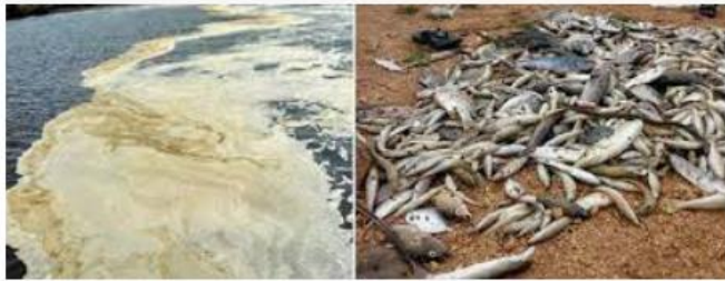
Fig 1 – VEDAN and Thi Vai river pollution