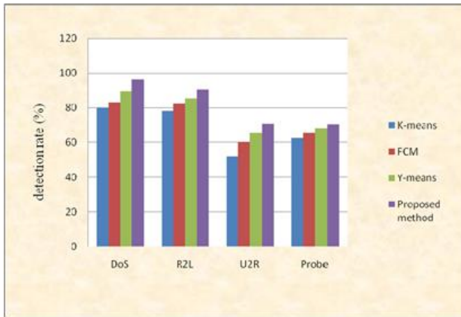
Figure 3. Comparisons of Detection Rate against various attacks

The figure 3 illustrates the percentage of detection rate of denial-of-service attack, remote to local attack, user to root attack and probe attack and comparisons are made for proposed method, K-means algorithm, Y-means algorithm and FCM algorithm. We observed from the figure that detection rate for our proposed approach is greater than earlier approaches.