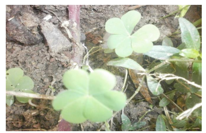
Figure 4: Oxalis corniculata