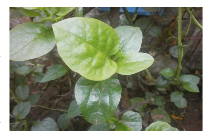
Figure 3: Basella alba

Roshan Adhikari et al.(2012) reported that Basella alba has been used from a long time back for the treatment of many diseases like dysentery, diarrhoea, anemia, cancer etc. It has also been utilized for different kinds of healing activities. The chemical composition of the leaf extract has been found to be: proteins, fat, vitamin A, vitamin C, vitamin E, vitamin K, vitamin B9 (folic acid), riboflavin, niacin, thiamine and minerals such as calcium, magnesium and iron. Some unique constituents of the plant are basellasaponins, kaempherol and betalain (Roshan Adhikari et al., 2012).