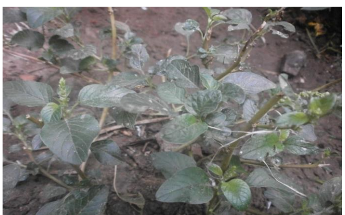
Figure 6: Amaranthus spinosus