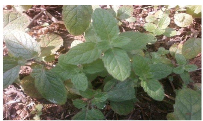
Figure 7 : Mentha arvensis