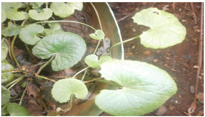
Figure 5: Centella asiatica