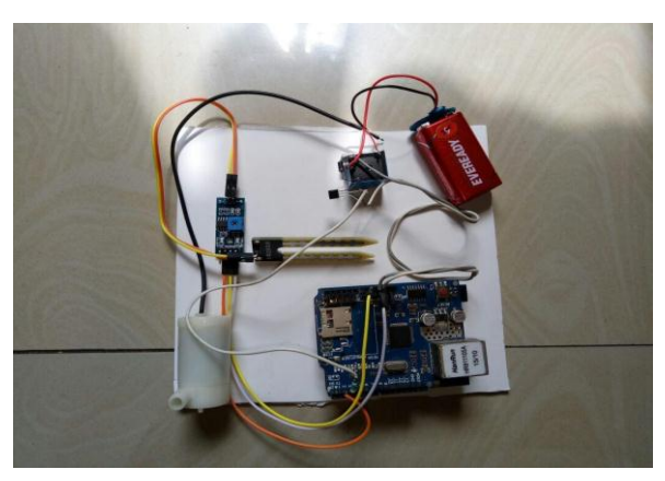
Figure 2. hardware connections