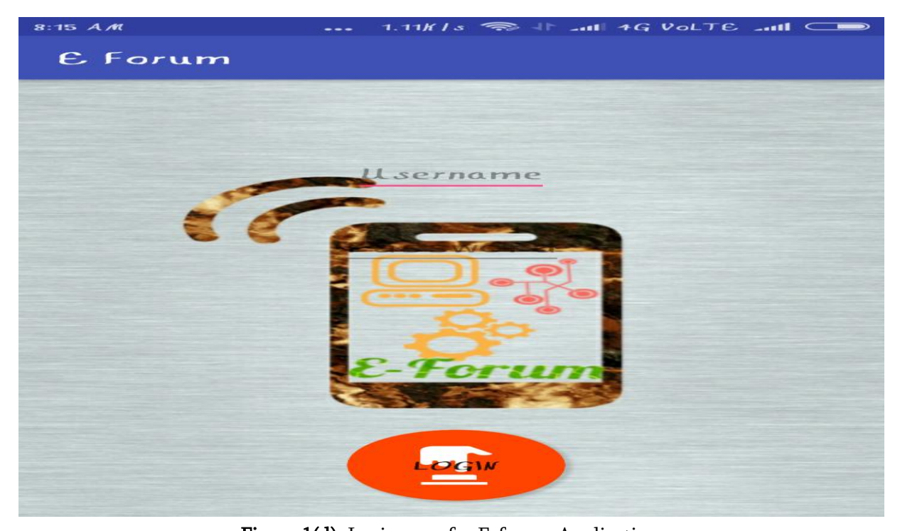
Figure 1(d). Login page for E-forum Application