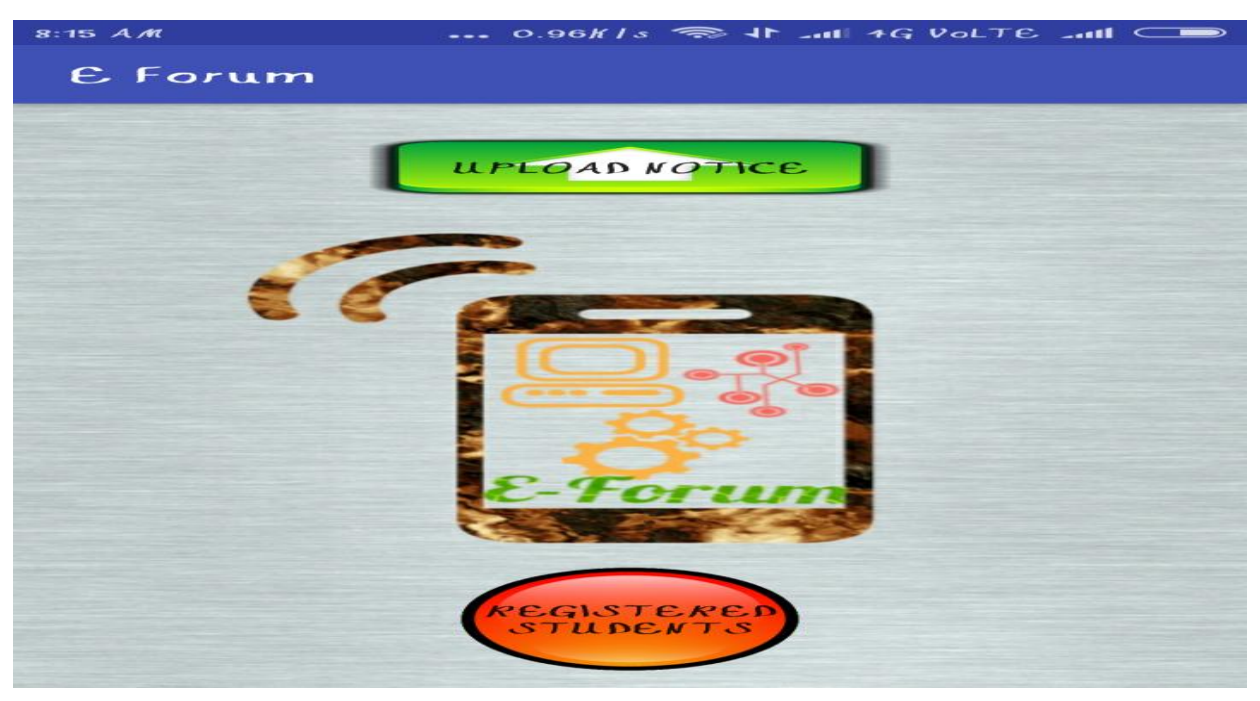
Figure 1(e). Upload notice page for E-forum Application