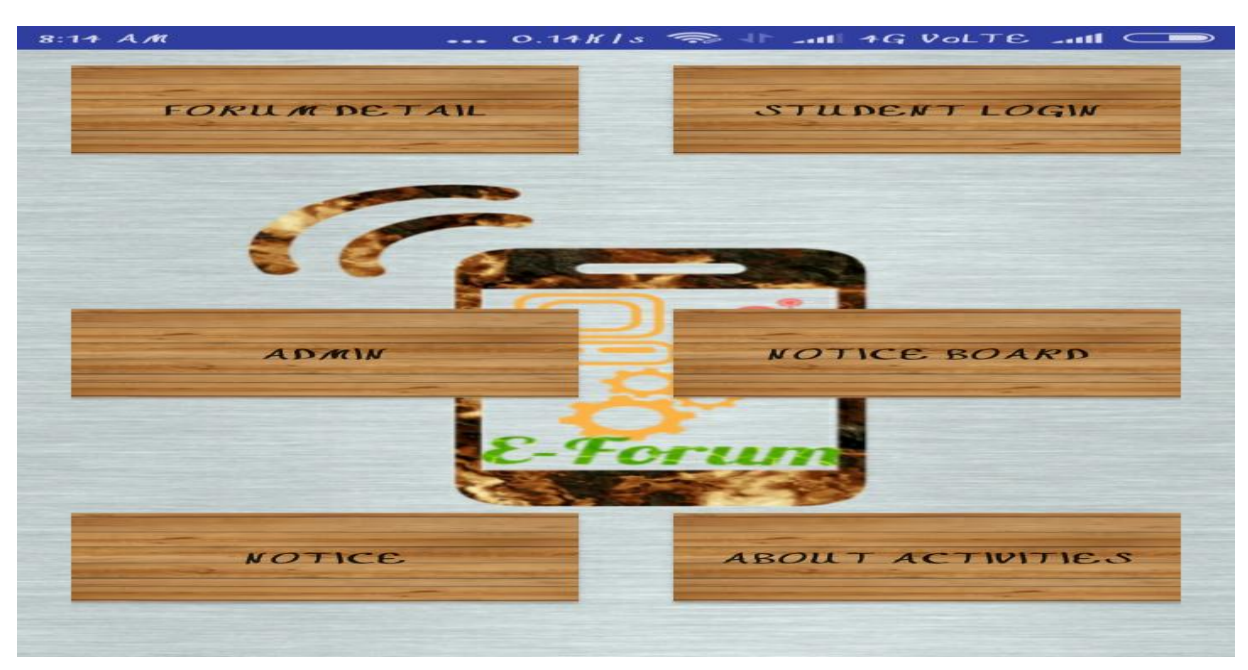
Figure 1(c). Menu page for E-forum Application