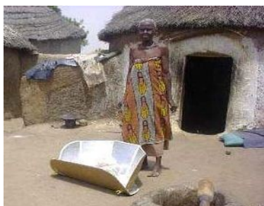
Solar cookers use sunlight as energy source for outdoor cooking.

Renewable energy is generally defined as energy that comes from resources, which are naturally replenished, on a human timescale such as sunlight, wind, rain, tides, waves and geothermal heat. Renewable energy replaces conventional fuels in four distinct areas: electricity generation, hot water/space heating, motor fuels, and rural (off-grid) energy services.