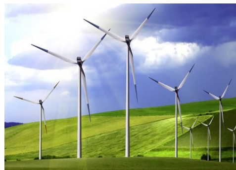
Wind mill as an energy resource

It exist wide geographical areas. In international public opinion surveys, there is strong support for promoting renewable sources such as solar power and wind power. At the national level, at least 30 nations around the world already have renewable energy contributing more than 20 percent of energy supply. The Intergovernmental Panel on Climate Change has said that there are few fundamental technological limits to integrating a portfolio of renewable energy technologies to meet most of total global energy demand. Mark Z. Jacobson says producing all new energy with wind power, solar power, and hydropower by 2030 is feasible and existing energy supply arrangements could be replaced by 2050.