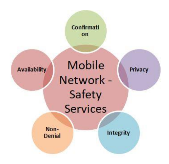
Figure 3: Mobile Network Safety Services