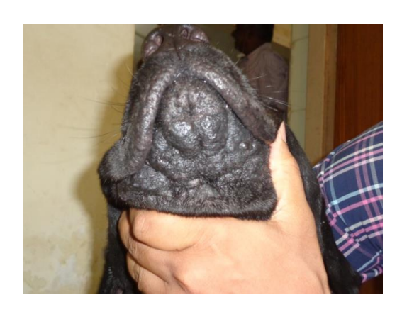
Figure 1. Moist Eczema of the chin region

Ivermec was given as ecto-endo parasiticide for the treatment of any parasitic infection, lixen contain cephalexin antibiotic given for the treatment of bacterial infection causing Soft tissue infection, Pyoderma (Skin infections due to coagulase positive Staphylococci), cetrizine was given as antiallergic medication, Multistar Pet is multivitamin which was given to enhance the immune system and for regeneration of healthy curabless terbinafine epithelium, contain hydrochloride(antifungal), ofloxacin (antibacterial). ornidazole (antiprotozoan) and clobetasol propionate(corticosteroid used to treat various skin disorders including eczema and psoriasis) which was given for the treatment of various types of skin problems.