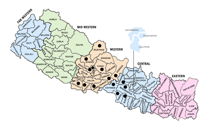
Figure 1. Three Geographical area of 15 district, Mountain, Hills and Tarai

According to GLOBOCAN 2012, an estimated 14.1 million new cancer cases and 8.2 million cancer related deaths occurred. Compared with 12.7 million and 7.6 million, respectively in 2008 (Ferlay et al., 2012)The importance of cancer registry data for development of national cancer control programs has already been stressed in the context of South Asia (Bhurgri, 2004).