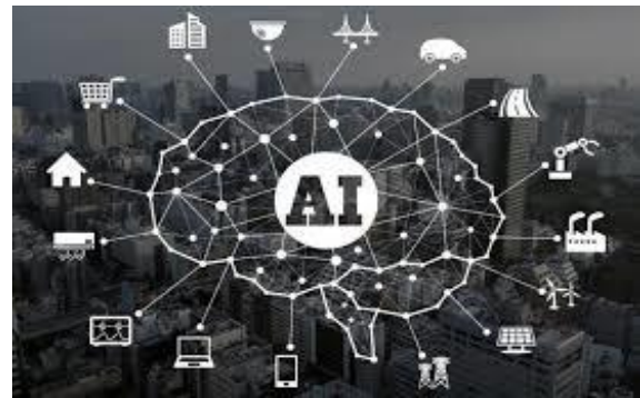
Figure 2. Illustrates possible sectors of industry and life that AI can have a great impact upon

Picturing AI as a relief to all the problems and difficulties human life on earth is facing is but a very optimistic truth, the harder part to imagine and being skeptical about is taking AI as not being driven by those human morals and resulting in disasters rather than alleviating us from our troubles.