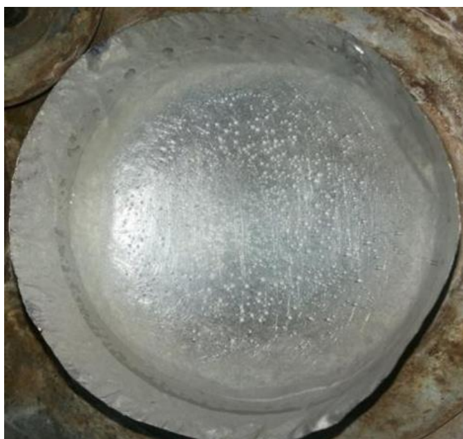
Figure: II : The final solution in 3% HNO 3 in platinum dish on boiling waterbath