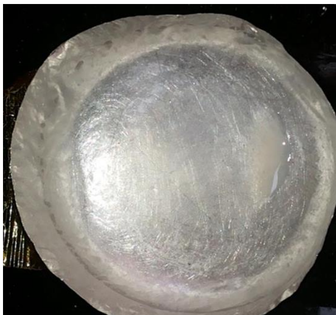
Figure I : The syrupy nature of digested sample using HF, HNO 3 and a drop of 1:1 H 2 SO 4