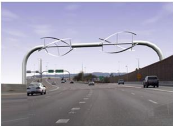
Fig 1 : Arizona State University Student Realistic Design.

The figures 1 show the different wind turbine designs on the highway. Each has its own design pros and cons. cabinets. This design is particularly difficult as spare parts must be installed vanes so that the wind produced by the vehicles reach the turbines. Chart shows the cheap design of the wind turbine. This design was not selected for safety reasons Remarks Parts are small and can be easily scrapped. Numbers shows the wind turbines offered by a student at the University of Arizona. This design: has been rejected because it requires the construction of special auxiliary stations.