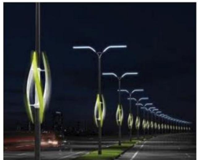
Fig 6 : VERTICAL BLADE DESIGN

It is a hollow tube On which the plates are attached. It should be large enough to illuminate the width of the streetlights.