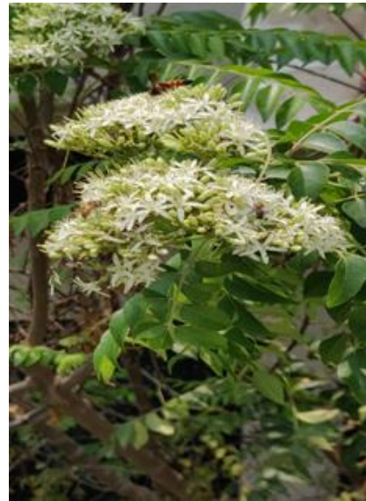
Apis florea, Apis dorsata, Apis cerana indica