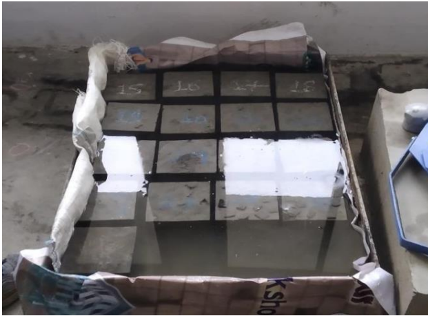
Figure 3 : Curing Of Cubes