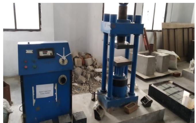
Figure 2 : Compression Testing Machine