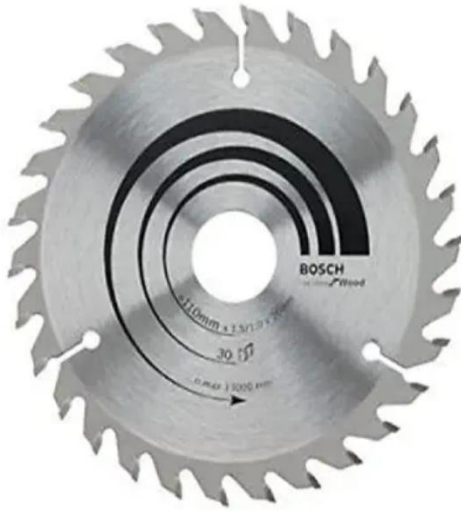
Figure 3.5 blade