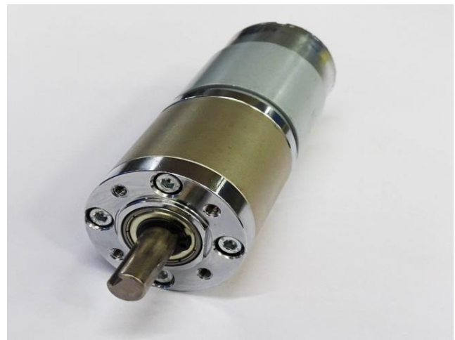
Figure 3.4 Motor

Cutter Blade: Different types of blades are used for operation to be done and these blades are made by cast iron, Stainless Steel, carbide steel. We are using Tungsten cutter blades for cutting purposes: The rotation of blade gains the cutting action.