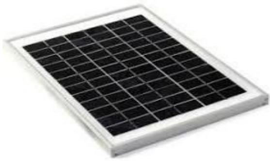
Figure 3.2 Solar panel