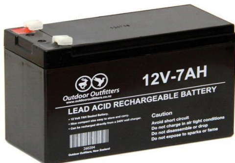
Figure 3.3 DC Battery

2) DC Motor: The motor used for the controlling the cutter, the permanent dc motor with 12V is used having the speed 1800rpm. this single-phase motor work on the Fleming hand rule and generate electric current and this electric current converted to mechanical work like to rotate the blade and cut the brush.