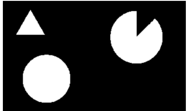
Figure 2: Silhouette using contour selection

method we have used the shape of the object such as object contour [2]. A contour is a closed curve of points or line segments that represents the boundaries of an object in the image. Contours are essentially the shapes of objects in an image. Contours are sometimes called a collection of points or line segments that overall represent the shape of the object in an image.