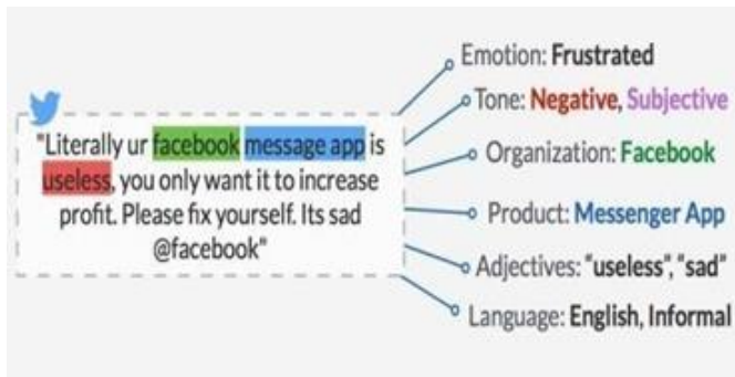
Figure 1: Understanding Language

semantic analysis. The meaning of words or tokens is extracted in this step. Object in task domain and mapping syntactic structure are responsible for meaning extraction from input. Next step is discourse integration where the meaning of sentence is tried to be extracted using the previous sentence meaning. Final step is pragmatic analysis. In this analysis, the main emphasis is on what was said is reinterpreted on what it actually meant. After all these steps the meaning of sentence is known to machine and it finds answer to user query and passes it to Natural language generation (NLG) for generation of final output. Natural language processing (NLP) is used in many chatbot for effective communication with humans. Below figure 1 shows Basic working of chatbot using Natural language processing (NLP).