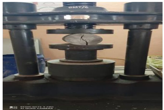
Fig 2 Testing on Cylinders