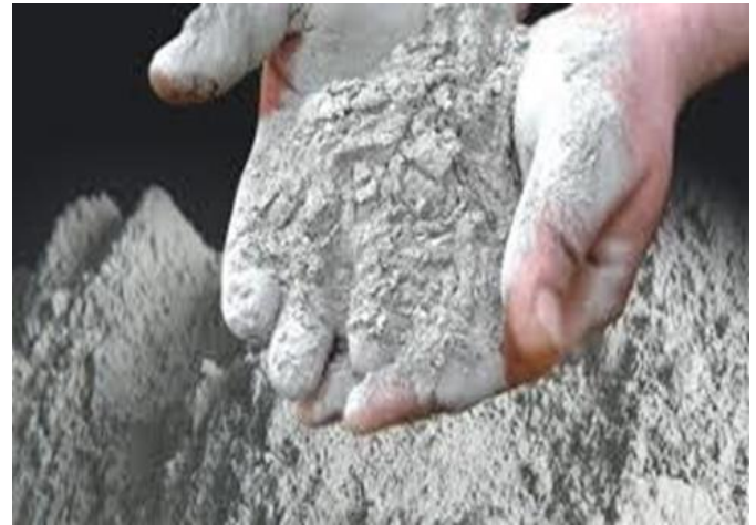
Fig 3.1 OPC 53 Grade Cement thermal stresses that could result in cracking