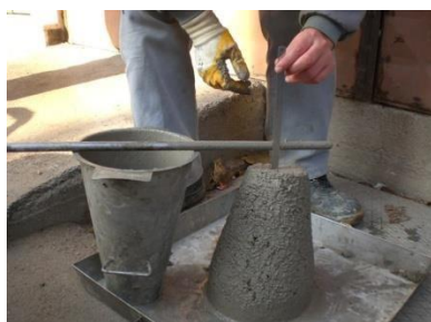
Fig 1 Slump Test